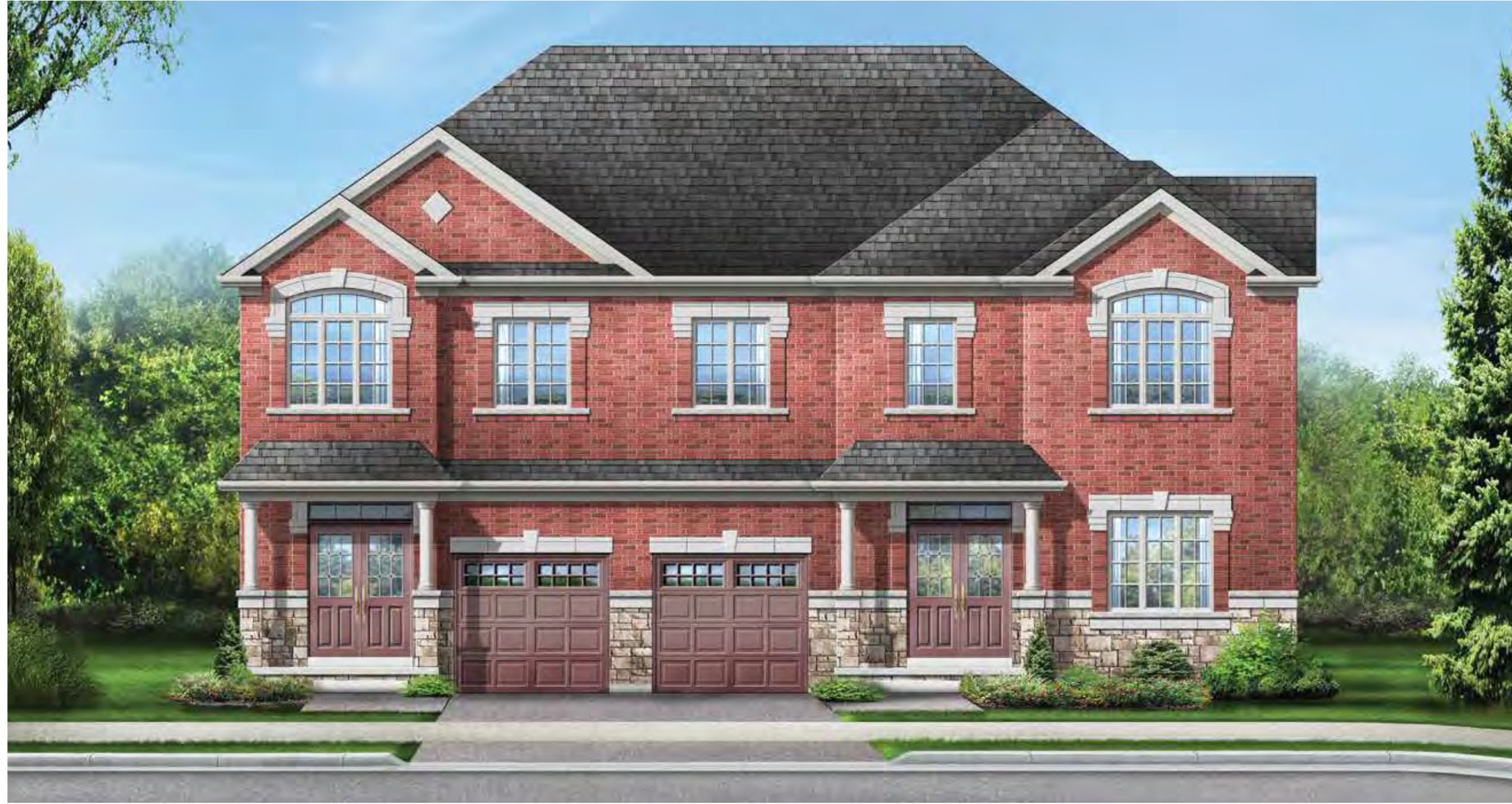
GLENDALE 5 • ELEVATION 4