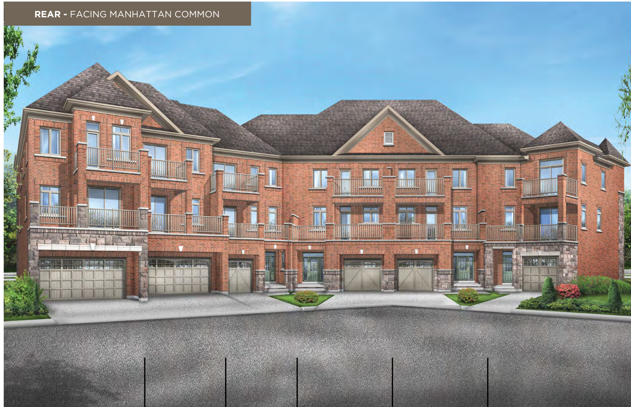
REAR - FACING MANHATTAN COMMON