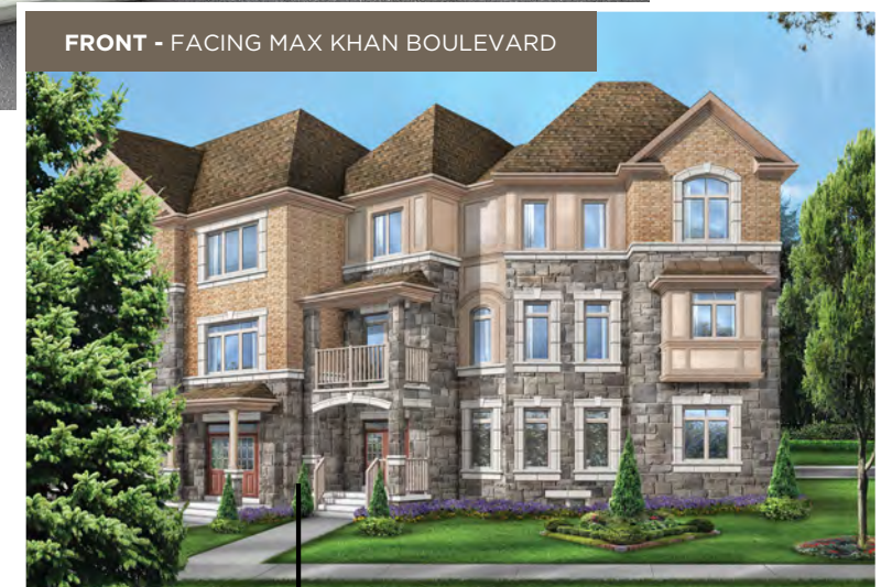
FRONT - FACING MAX KHAN BOULEVARD