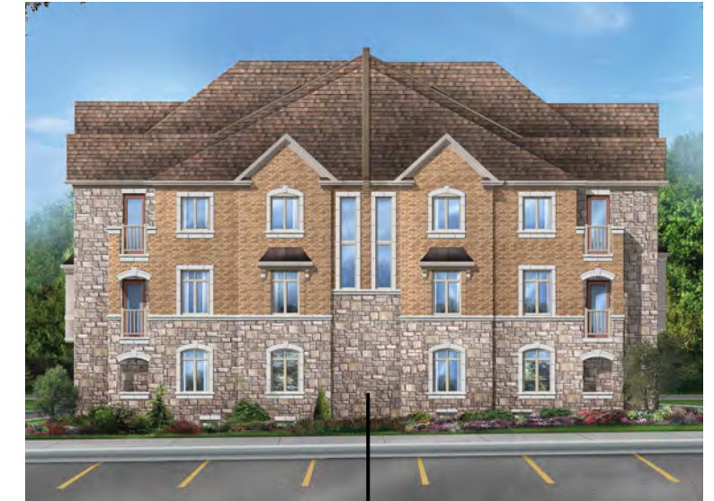
OAKLEY 4 FLANKAGE ELEV. 2 • TH-68