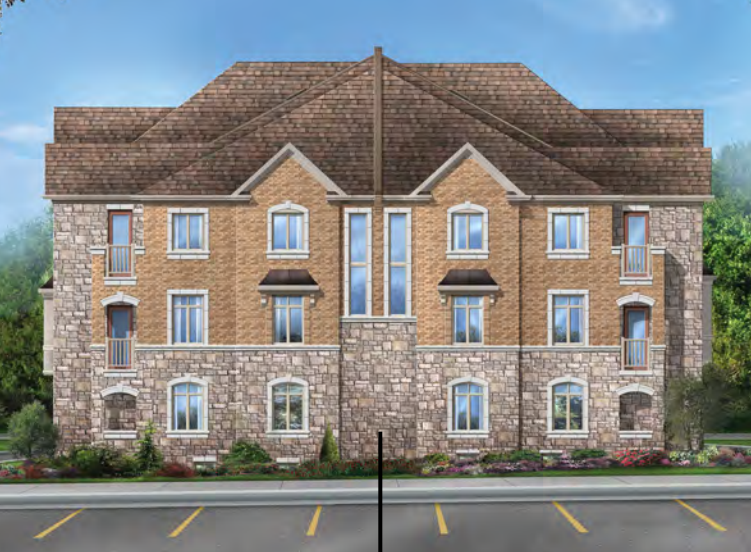
OAKLEY 4 FLANKAGE ELEV. 2 • TH-35