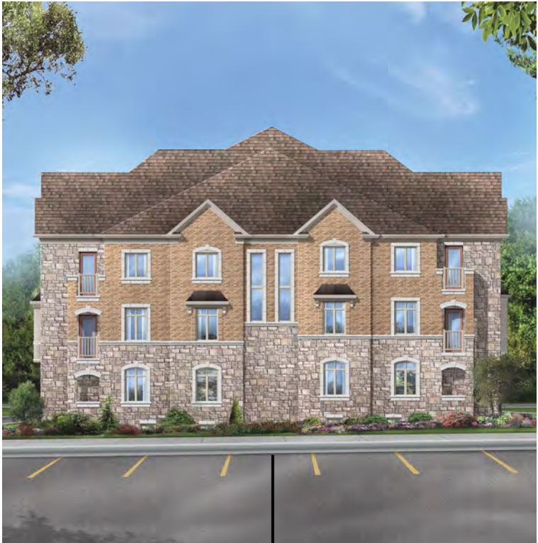
OAKLEY 4 FLANKAGE ELEV. 2 • TH-14