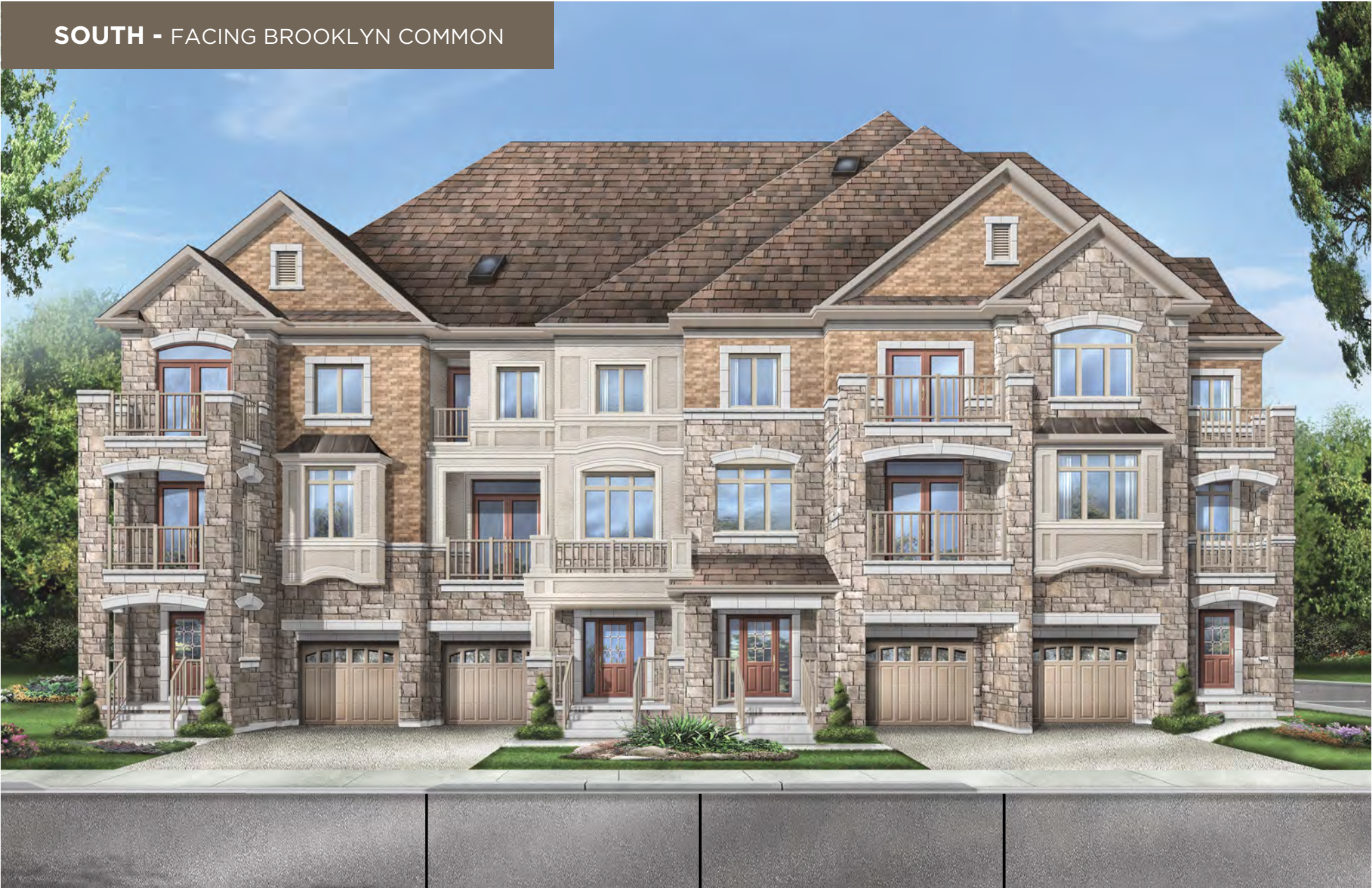
SOUTH - FACING BROOKLYN COMMON