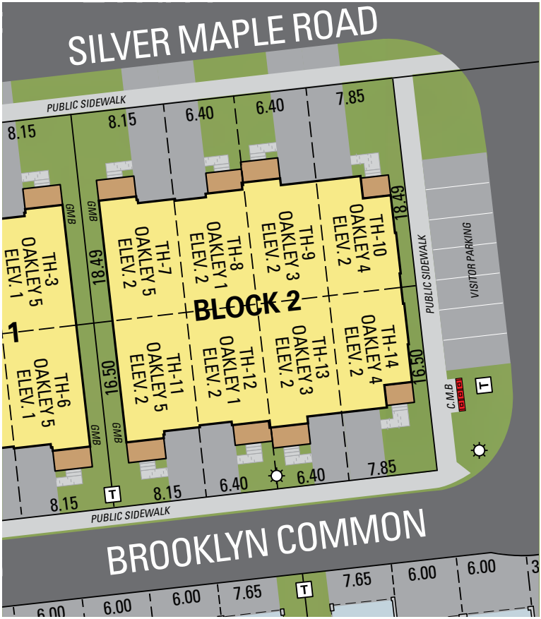
BLOCK 2 SITE PLAN